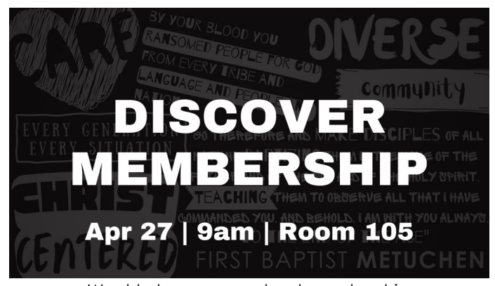
Want to know more about membership at First Baptist Metuchen? See you at the informational, no-obligation Membership Seminar.