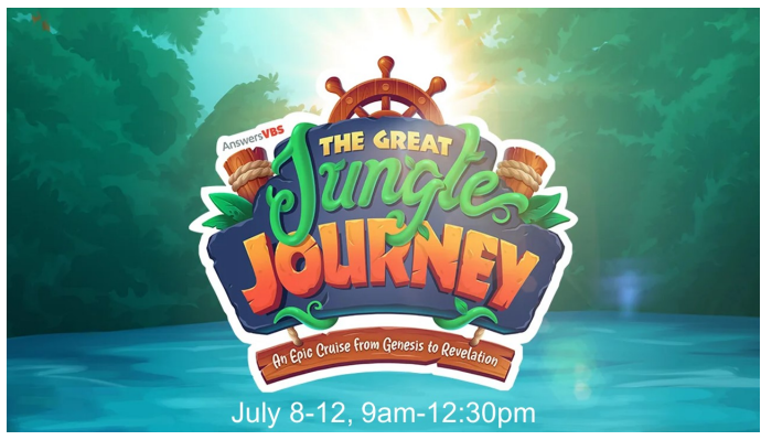
Summer Outreach - VBS! Visit the kiosk in the Welcome Center Register or Volunteer at fbcmonline.org