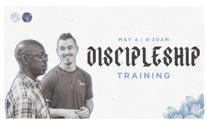
Join us for a hot breakfast and hear more about discipleship at First Baptist Metuchen. Sign up at the Welcome Desk.